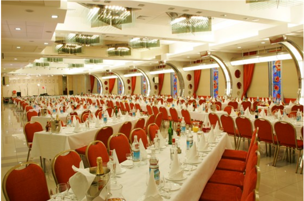
EDSO Congress Hall / Farewell Hall

The Cosmos Hotel Moscow is located in the north-east Moscow on one of the city's major streets - prospect Mira, in green district, just 20 minutes drive to the centre. It is next to the All-Russia Exhibition Centre (V.V.C.), close to Ostankino Telecom Tower, Count Sheremetyev's Palace, the "Olimpijsky" Sports Complex and the "Sokolniki" Exhibition Complex.