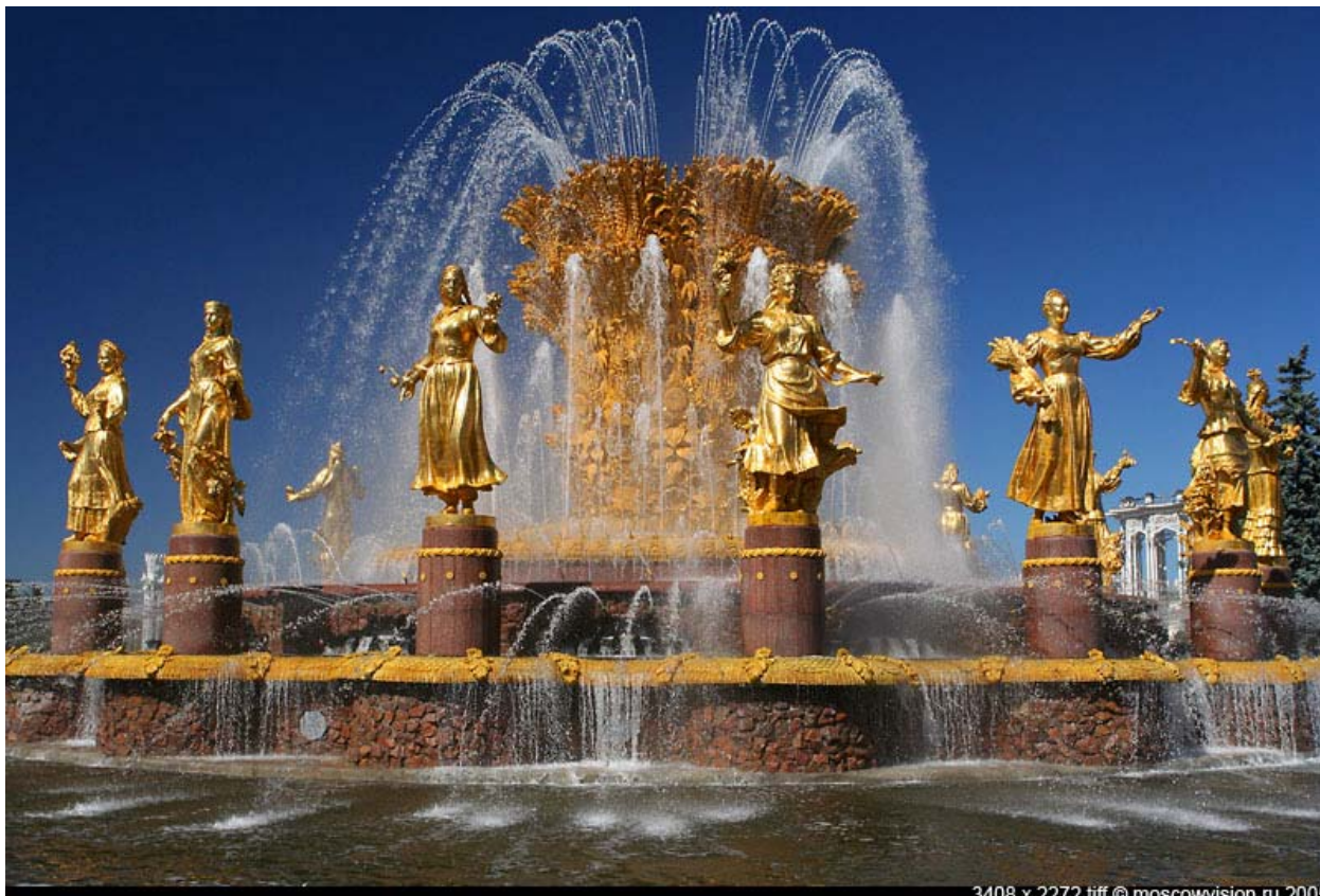
All-Russian Exhibition Centre (V.V.C.)

There are 10 restaurants and cafés at Cosmos Hotel, all with free Wi-Fi. Planet Cosmos restaurant serves Russian and European cuisine and offers views of the Moscow skyline from the 25th floor.